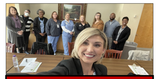
Swainsboro Behavioral Health & Community Coalition