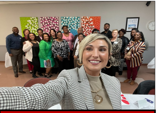
Laurens, Johnson, & Emanuel Collaborative