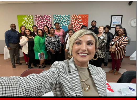
Laurens, Johnson, & Emanuel Collaborative